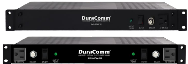
RMI-400W-1U (top) & RMI-800W-1U (bottom)