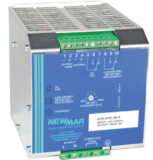
DIN-UPS 24-10/48-5 (Case Size B)