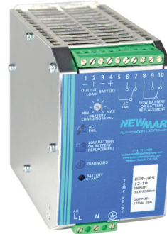
DIN-UPS 12-10 (Case Size A)