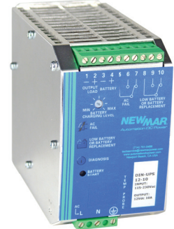
DIN-UPS 12-10 (Case Size A)