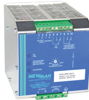
DIN-UPS 24-10/48-5 (Case Size B)