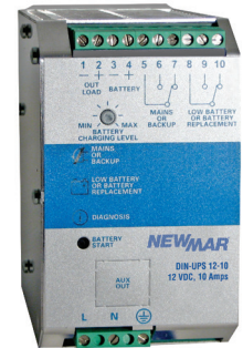
DIN-UPS 12-10 (Case Size A)