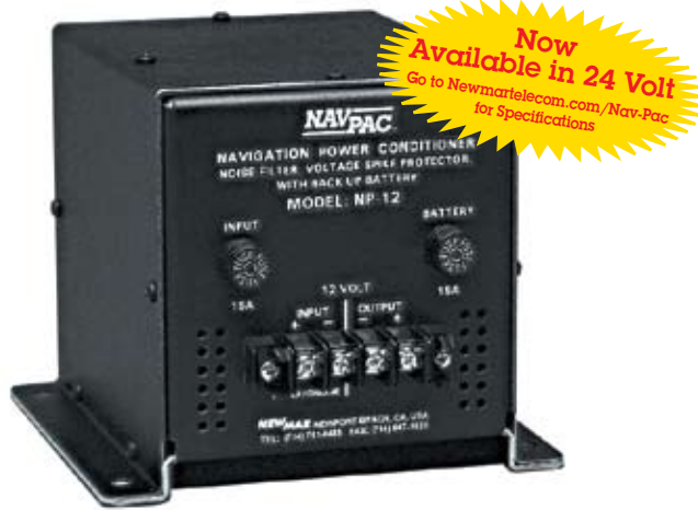
Provides Continuous Voltage Protection