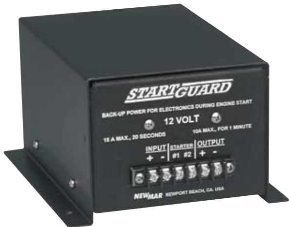
Provides Voltage Protection During Engine Start

The abrupt DC system voltage drop that accompanies engine starting can cause microprocessor-based voice and data transmitters to "dump" programmed memory.