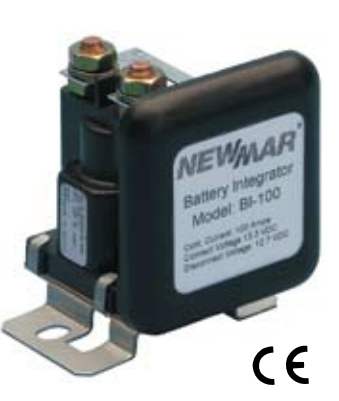
BI-100 ; 12 volts, 100 amps max BI-24-100 ; 24 volts, 100 amps max

The Battery Integrator enables charging of two separate banks from a single source, yet maintains 100% isolation at all other times. A voltage comparator circuit and low resistance contactor act as a "smart" switch, connecting independent battery banks only when a charging voltage is present, then disconnecting them for selective discharge. Because diodes are not used, there is no voltage drop