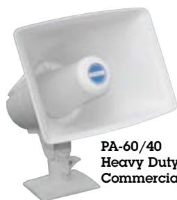
PA-60/40 Heavy Duty Commercial

Clear, distortion-free waterproof speakers are ideal for paging and alarm systems. Constructed of high impact plastic with stainless steel hardware. Impedance (all models) 8 Ohms.