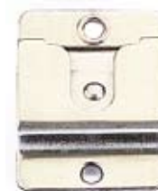
Model: Spring Clip

All stainless steel. For securing standard VHF microphone when not in use. Lift to release.